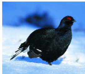
Black Grouse

We have an exceptional opportunity now to purchase the Dundreggan estate in Glen Moriston, where we will be able to bring together all the elements of our forest conservation work in an integrated, cohesive whole, to restore the Dundreggan Wild Forest . We've had the estate valued at £1.6 million and thanks to several inspired supporters we have already raised about half of this amount. We are applying to a number of Foundations for assistance, but we really need your help to achieve our goal of buying Dundreggan and returning this area of outstanding beauty back to wild forest, forever!