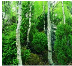
Birch and juniper woodland on the Dundreggan Estate

With your help now, the purchase of Dundreggan will enable us to: