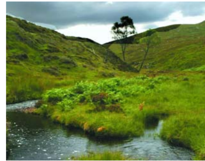
These remnant birches indicate the extent of the former forest on Dundreggan, and the potential for its restoration

Trees for Life is an award-winning charity working to restore the Caledonian Forest to a large contiguous area of the Highlands of Scotland. Since 1989, in partnership with various landowners, we have planted over half a million trees and facilitated the natural regeneration of ancient forest remnants in Glen Affric and the surrounding area.