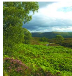
These birches await a new generation of young trees

Situated in Glen Moriston, just south of Glen Affric, Dundreggan Estate covers 4,000 hectares (10,000 acres) of land, and is an ideal site for the restoration of the Caledonian Forest. It contains a good remnant of ancient woodland and much of the open land is suitable for trees, while dwarf birch (a key montane scrub species) is also widespread. Of particular note is the outstanding area of large junipers in the woodland, while the estate also has significant populations of important (and declining) species such as black grouse and wood ants.