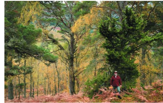
Some of the junipers on Dundreggan are over 5 metres tall

Of course other amounts are also welcome - why not get together with friends or family and increase your support?