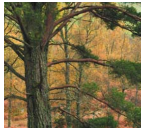
Scots pine in the ancient woodland on Dundreggan